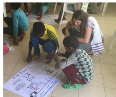
Social mapping in Ethiopia, Protecting Children in East Africa