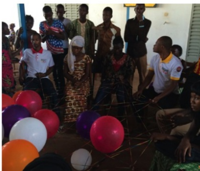
Participatory tools used to evaluate Right to Play programming in Mali

-Armel Oguniyi, IICRD Associate, supporting youth in Chad, Africa to develop skill-based stamps as part of the Child Protection in Development Program