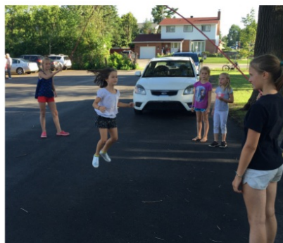
Children engaging in purposeful play Gatineau, Canada