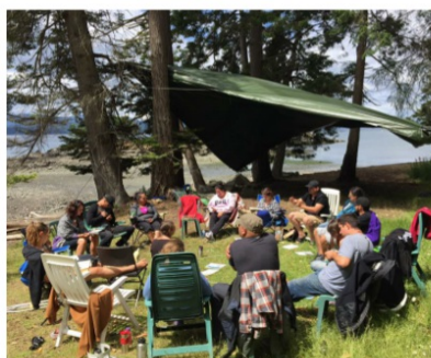
YouLEAD Journey Course Pender Island