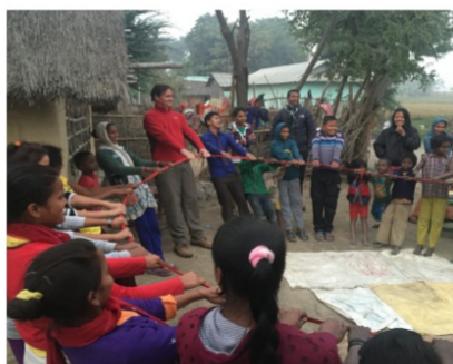
Unity Circle in Nepal Changing Social Norms