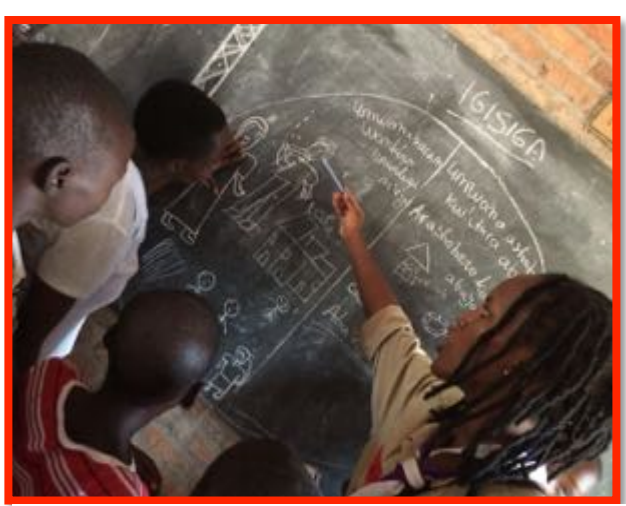
Social Mapping Burundi

A number of significant risks as well as protective factors affecting social cohesion and child protection have, nevertheless, been ascertained by study participants, including the repatriation of refugees; land issues, food insecurity and constrained livelihood options; poverty; family relations and social support; education and schooling; unmarried mothers and unwanted pregnancies; orphans; the various manifestations of violence in the country; and, the role of groups and associations in Burundi, and poverty, child trafficking, the worst forms of child labor, violence, early