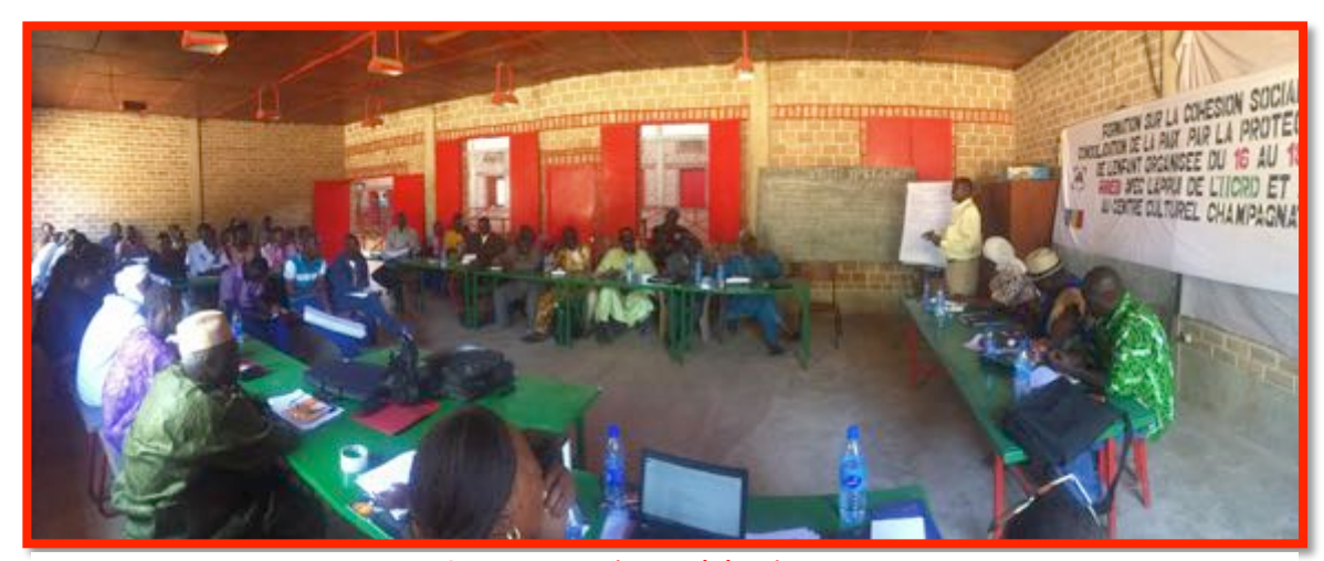
Outcome Mapping Workshop in Koumra

protection, 2) Civil society (e.g. NGO's, media, human rights institutions) leaders, 3) Women's groups, 4) Traditional leaders, and 5) Youth 25 representatives aged 16-25.