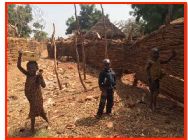
Children of Koumra

Many conflict related drivers of risk for children have antecedents in broader community violence. Recently interest has grown on including child protection as a core component of broader social cohesion strengthening. Socially cohesive societies are characterized by the principles of inclusion, participation and social justice. Inclusion refers to embracing – not coercing or forcing – diversity, and ensuring equal opportunities – that everyone,